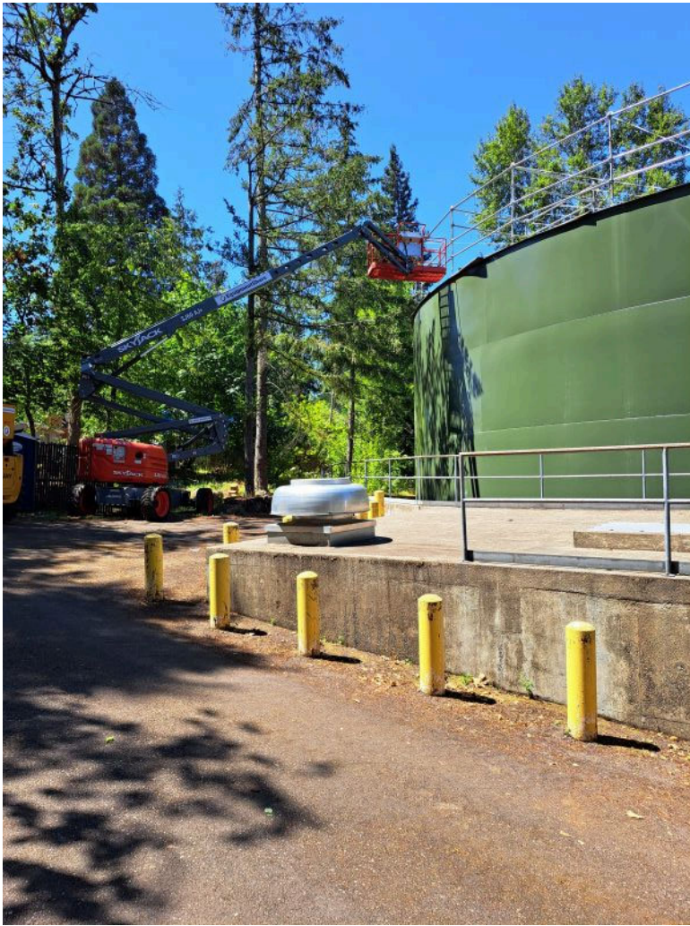
A blastrac machine was lifted onto the reservoir's roof.